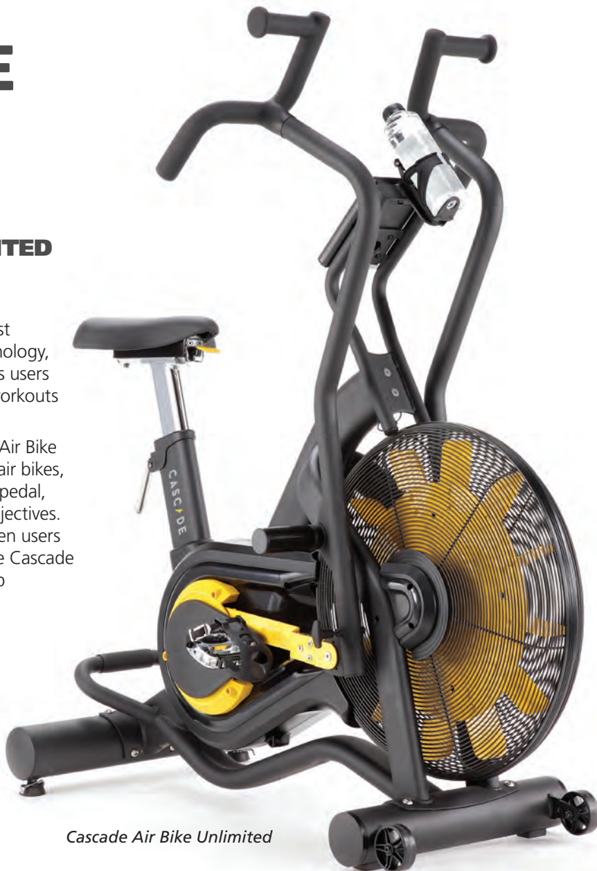
Cascade Air Bike Unlimited

Comfortable and easy to use, the Cascade Air Bike offers unlimited air resistance. Like with all air bikes, the individual controls the intensity as they pedal, push, and pull to meet their own fitness objectives. The large foot pegs also make it simple when users only want a great upper body workout. The Cascade Unlimited model is designed with multi-grip handlebars and pedals with cages.