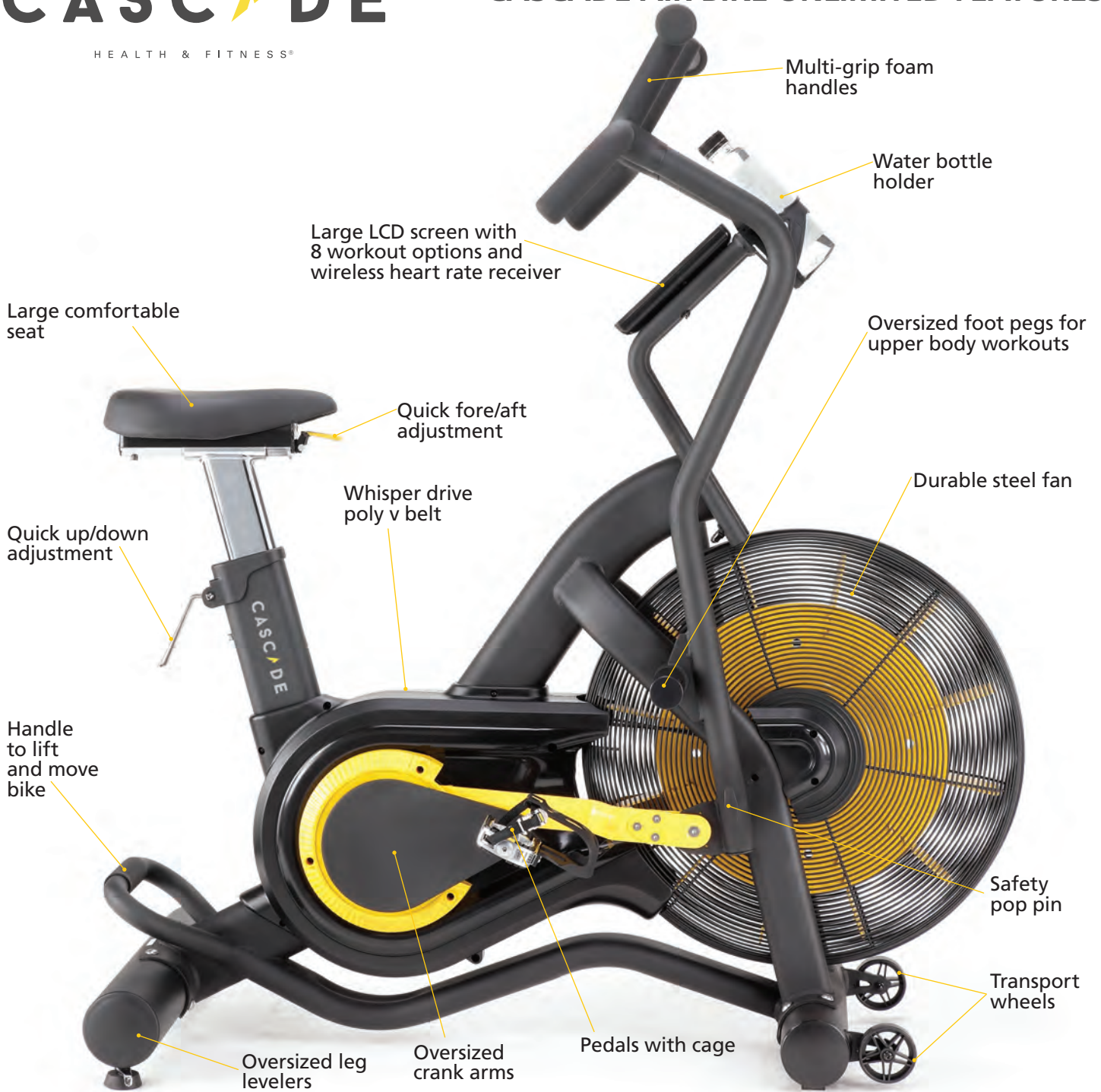
Cascade Air Bike Unlimited