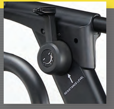
Easy To Adjust Lever

Anti-slip heavy duty rubber molded slats have exceptional durability with sealed cartridge bearings for smooth and quiet exercise.