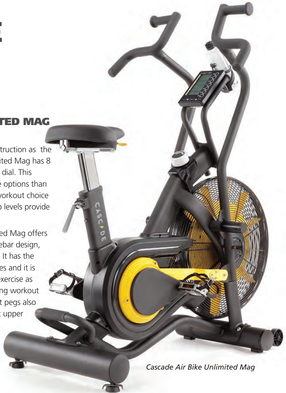
Cascade Air Bike Unlimited Mag

Like all Cascade Air Bike models, the Unlimited Mag offers infinite air resistance with a multi-grip handlebar design, especially versatile for upper body workouts. It has the same tough construction and durable features and it is ideal for both users needing low resistance exercise as well as offering a high intensity heart pumping workout for more conditioned athletes. The large foot pegs also make it simple when users only want a great upper body workout.